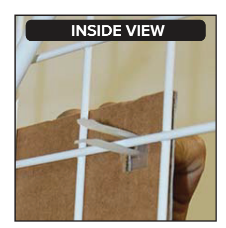
2. Use male fastener to clip onto wire grid.

Use female fastener to lock vertical signage onto wire grid. Complete by firmly pushing the connectors together so that the fasteners are completely seated. REPEAT FOR ALL FOUR CORNERS.